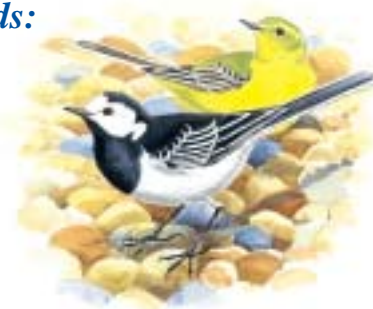
Pied and yellow wagtail

The Ver Valley Walk is a linear route between Redbourn and Bricket Wood. A leaflet is available from the CMS