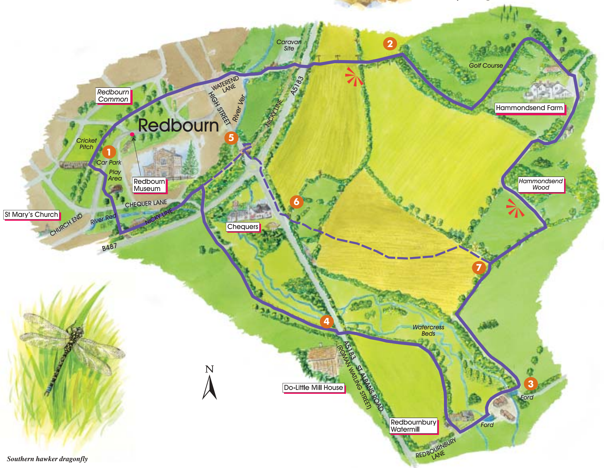
Southern hawker dragonfly