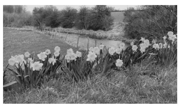
The Ver from Blue House Hill - (Bob Aldritt)