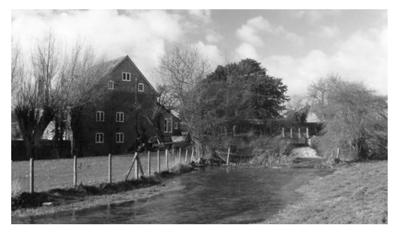
Redbournbury Mill