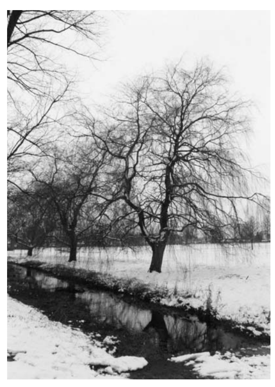
River Red in Winter White - (Bob Aldritt)