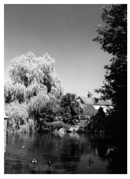
View from St Michaels Bridge - (Bob Aldritt)