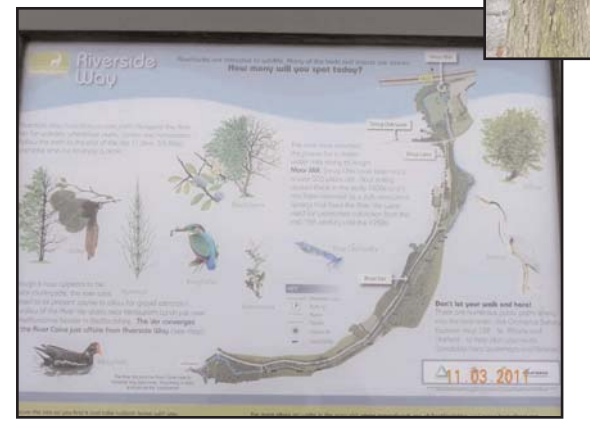
The new Riverside Way sign board.