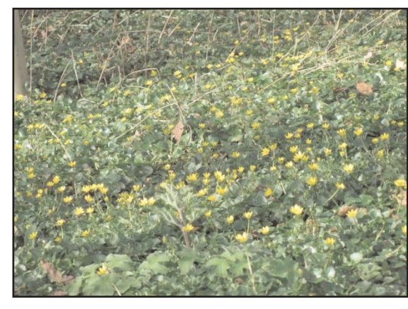
A gorgeous bank of celandine. [Jane Gardiner]

spikes, which can be actually in the water. Flag iris and king cups are just beginning to show. Although some rain would be welcome spring is just lovely as I write!