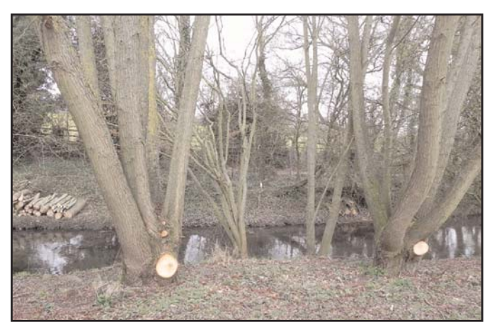
Safety work along Riverside Way.

Meanwhile Jane Gardiner collected three bags of miscellaneous litter near the stepping stones and confluence. Unfortunately, the river was too deep to cross to remove more plastic bottles along the Ver and the Colne, but we hope that other volunteers will come forward later in the year to help with this work.