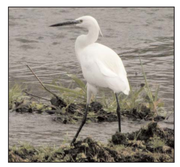
Little egret along the Ver at Redbourn.

This winter we have put up two kestrel boxes, a tawny owl box and a little owl box and we have resited a barn owl box which had been used by grey squirrels every year since 2005. Hopefully they will not use it again as it is a