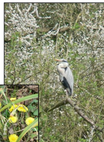
Coltsfoot (left), heron in blackthorn (above).