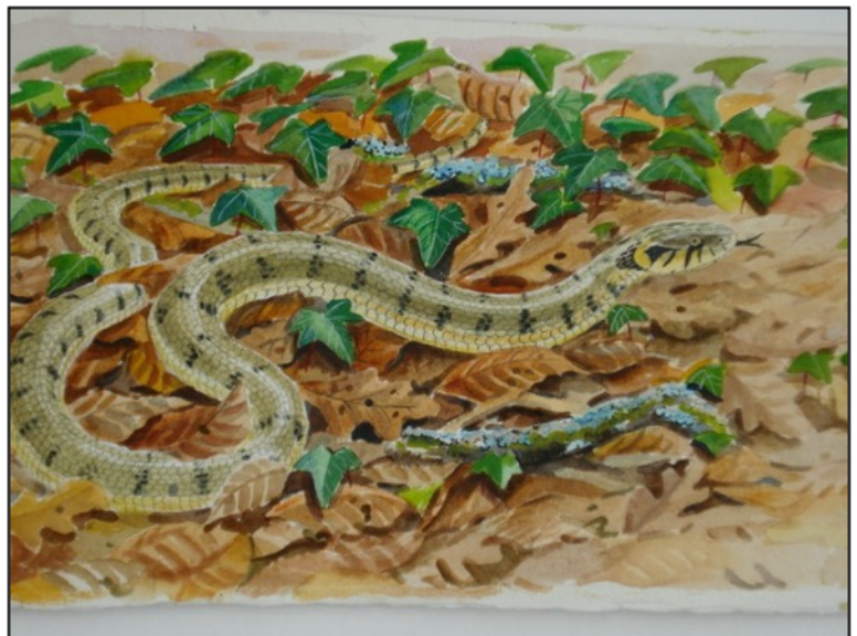
Grass snake - painting by Ernie Leahy

a pre-mating inter-twined group. They have an affinity for water as their favoured prey are frogs and tadpoles but they also have a fondness for Short Tailed Field Voles. The colour of the majority of these snakes is a pale olive green upper with black markings spaced laterally along the body. The head has a darker crown over yellow and black cheeks. Up to 40 eggs are laid in warm decaying vegetation before the 15cm long hatch in late summer though they will take about three years to reach about 80cm and maturity. The most likely sighting is of one swimming away but if you attempt to catch one you will encounter its foul smell which is emitted to deter enemies.