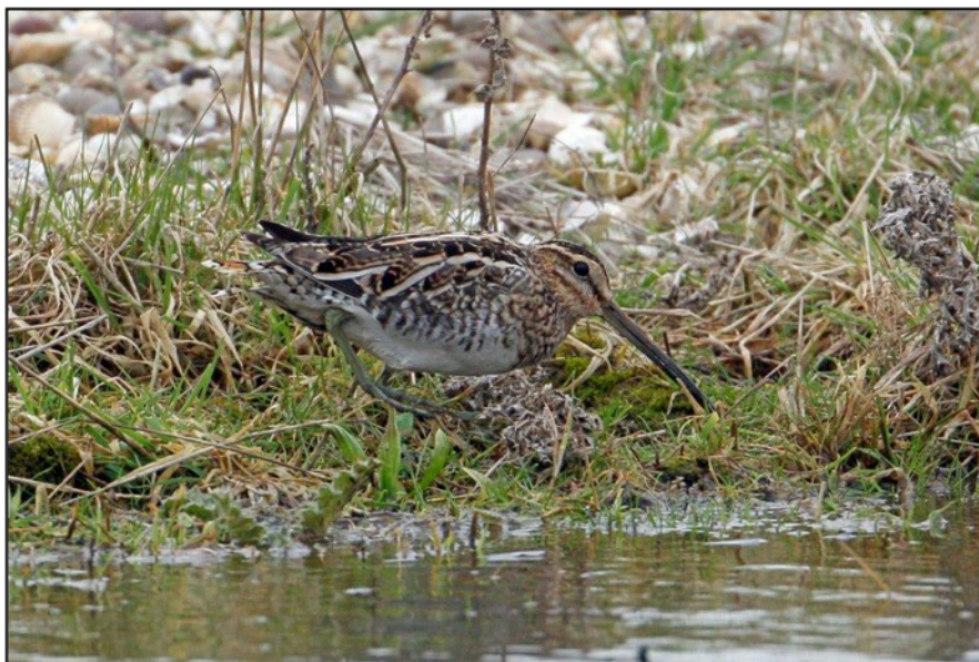
Common snipe

kestrel, heron and little egret. Also impressive were several singing skylarks. The sad thing is that with the last two dry winters the Ver has been dry north of Redbourn for sometime and by mid-summer it is likely to be dry right through to St Albans.