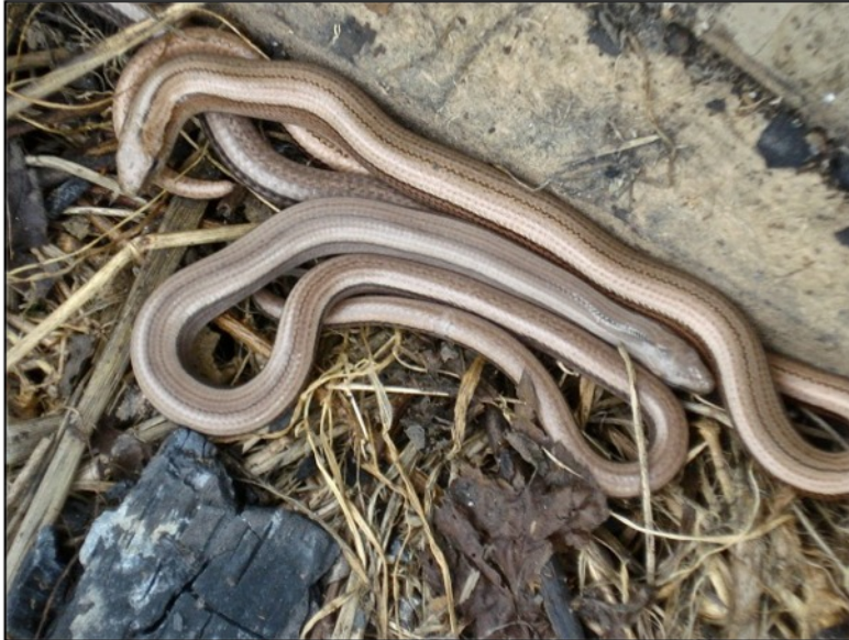
Slow Worms (Ernie Leahy)

Slow Worm colonies are known in Redbourn and in the Watercress Wildlife Reserve in St Albans although they are likely to be found in suitable habitats like allotments in the southern end of the Ver Valley. The slow worm often mistaken for a small snake is in fact a legless lizard sometimes found warming up its cold blooded metabolism on sunny days, usually in a dryer location after hibernation which is from October to March. Most of their lives is spent in small groups under natural debris but often they prefer large articles of human rubbish such as corrugated iron sheets for shelter.