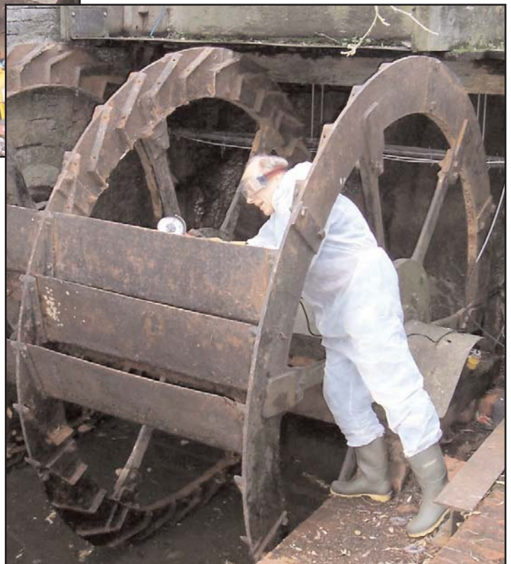
Volunteers cleaning ironwork and fitting new buckets.