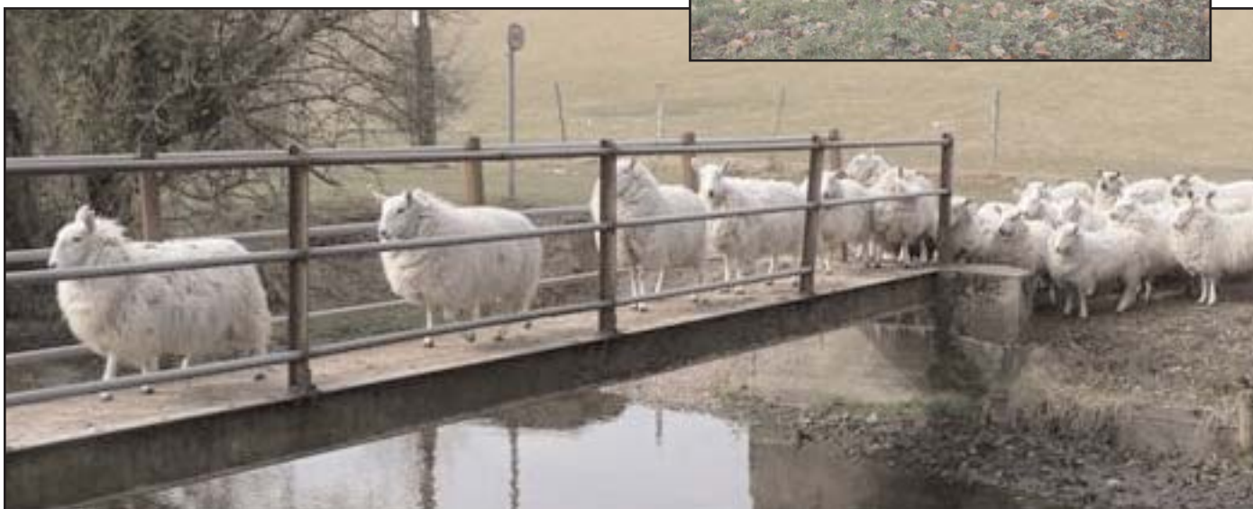
Sheep crossing near New Barnes Mill.