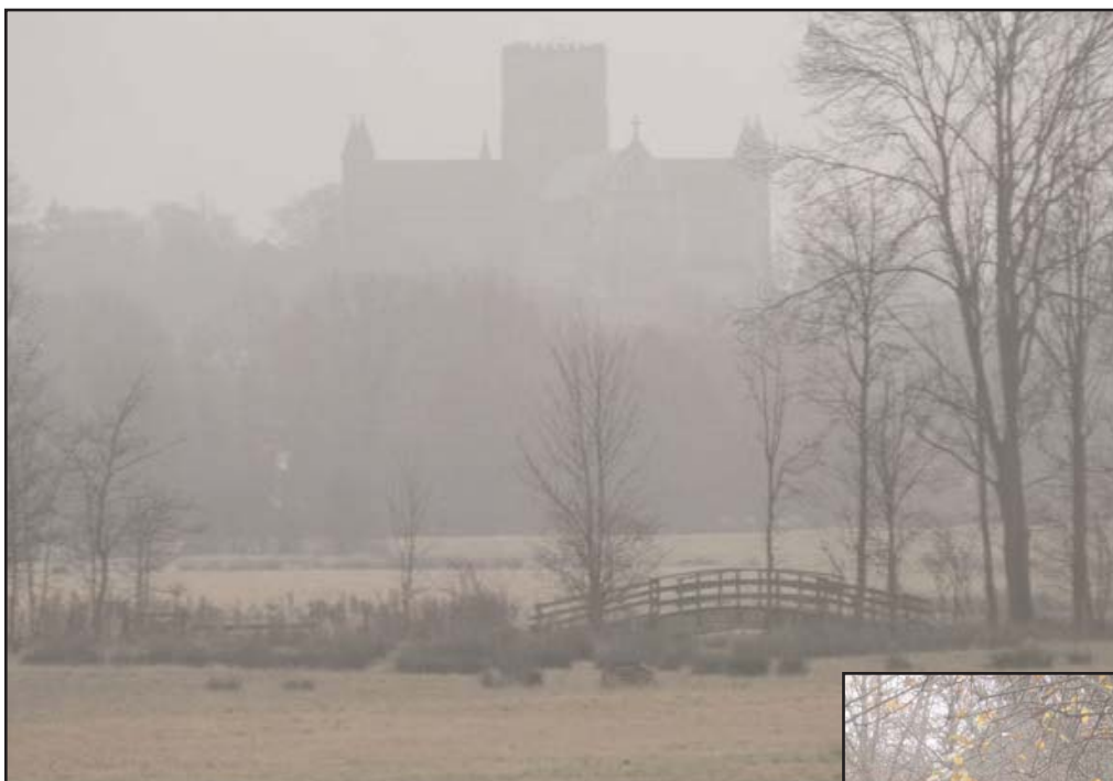
A misty view of St Albans abbey.