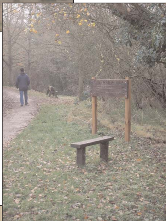
Riverside Way walk, near Moor Mill.