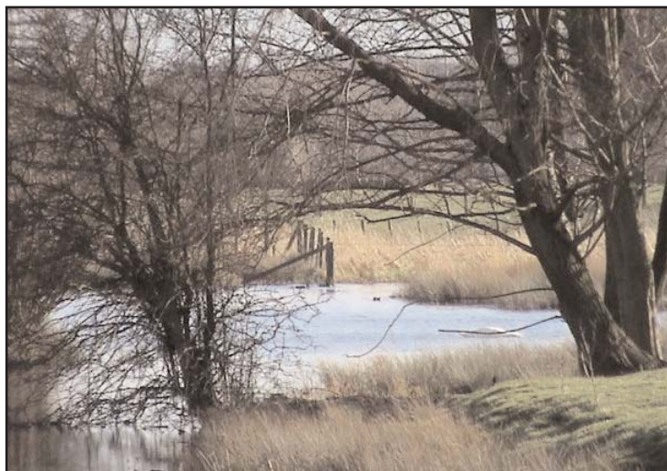
Wintry river Ver near Redbournbury

The annual accounts were presented by the Treasurer and approved nem con (copies available on request).