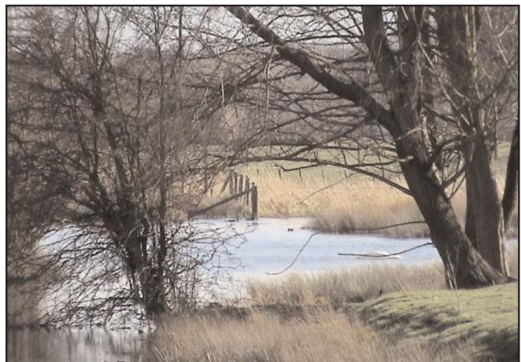
Wintry river Ver near Redbournbury

The annual accounts were presented by the Treasurer and approved nem con (copies available on request).