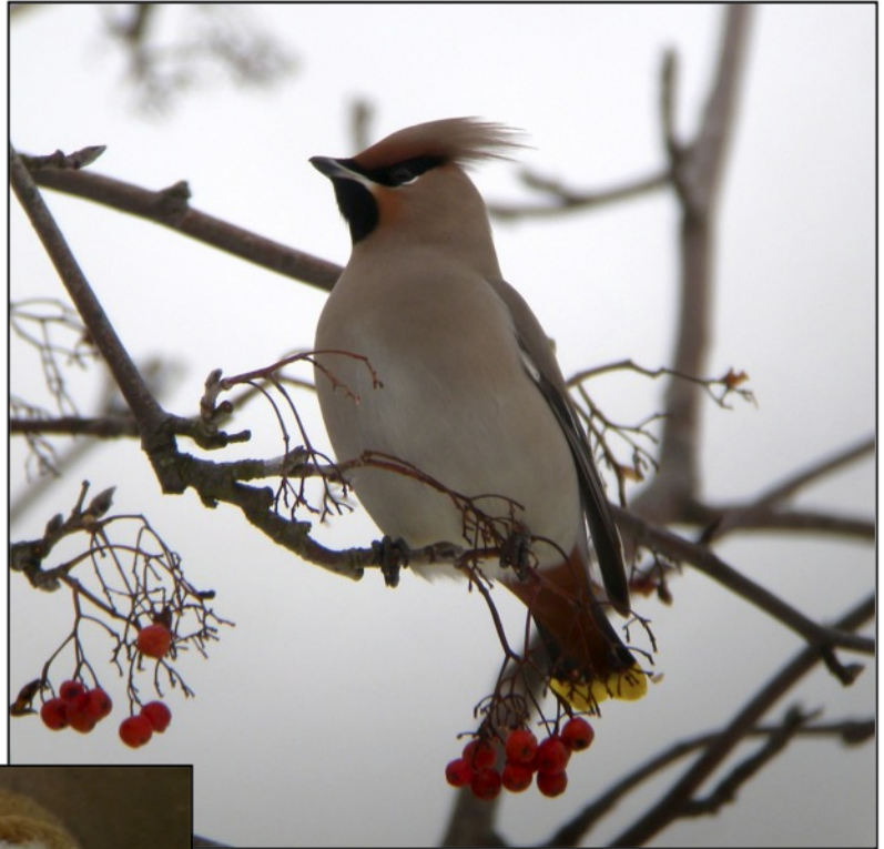
Waxwing