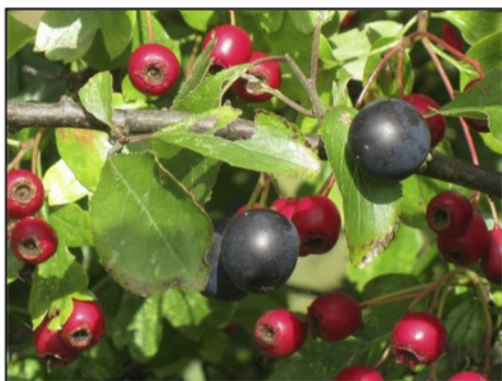
Above: hips and sloes.

You will probably all remember how colourful the trees have been this autumn has been with hedges full of bright berries and lots of fungi appearing, possibly all due to the unusual weather this year.