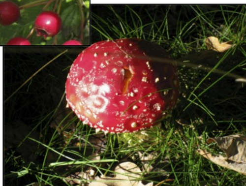
Right: Fly agaric