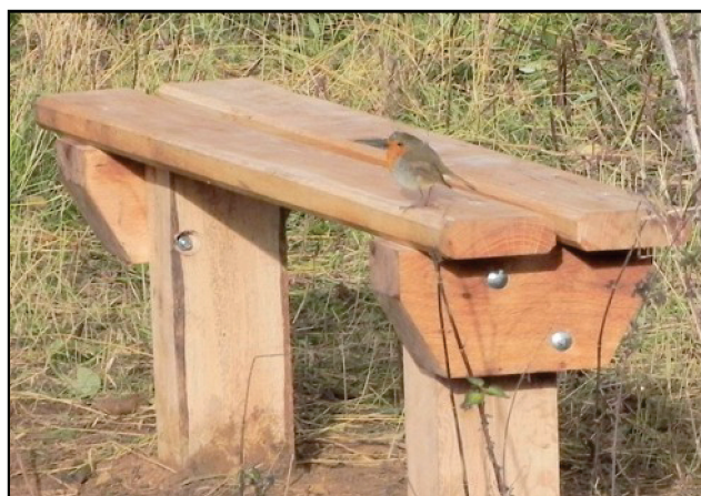
This robin soon found the new VVS bench.

Our annual get together at the Chequers, Redbourn was a pleasant morning clearing the Ver and Red of debris. It was good that twenty volunteers could attend and I was able to thank so many of our volunteers in person for their hard work over the year and to wish them the Seasons' Greetings afterwards in the pub.