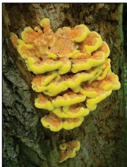
Chicken of the woods.

Some very nice bird sightings recently recorded are of a water rail, a woodcock and a flock of 30 red-legged partridges.