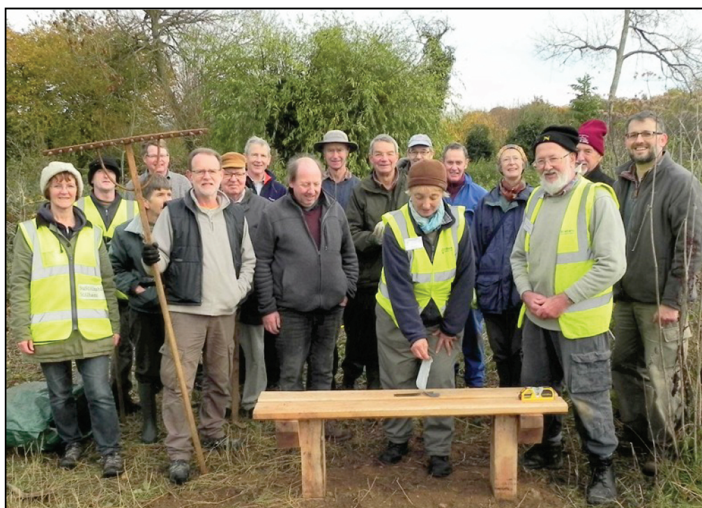
VAG Volunteers Around the 40 th Anniversary Bench at Sopwell Nunnery Green.

He has also set up The Farmschool at Annables Farm which aims to reconnect children with agriculture, habitats and rural land use.