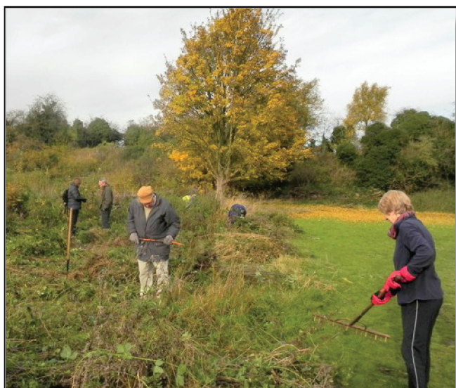
Sustainability St Albans VVS volunteers clearing the bramble in front of the laid hedge.

10.00 -12.00 Sopwell Manor Meadows (parking at the New Barn Mill car park, Cotton Mill Lane). Cross the bridge and down the footpath to the meadows, where we will remove overhanging trees and blockages in the river.