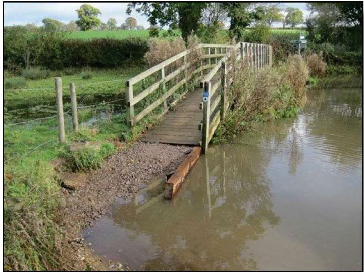
East Bridge at Redbournbury. [Jane Gardiner]

Redbournbury Fords. I am pleased to be able to report that the remedial work to the bridge at the Redbournbury East ford has now been completed to a good standard. Unfortunately the outlet from the ford pool had been very blocked causing water to back up. The EA have now had the outlet channel cleared to some extent and the water level has dropped slightly. However the field behind the ford is full of water so the channel must still be partly blocked, perhaps further downstream, and the gravel added to the approaches to the bridge and seat has been washed away and will need replacing in due course.