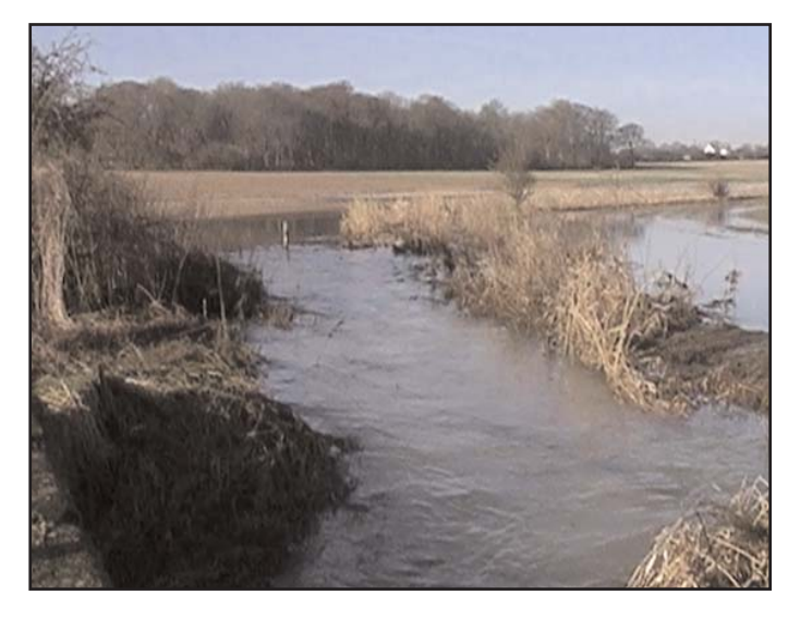
The Ver in Flood at Luton Lane Redbourn - Alan Bull