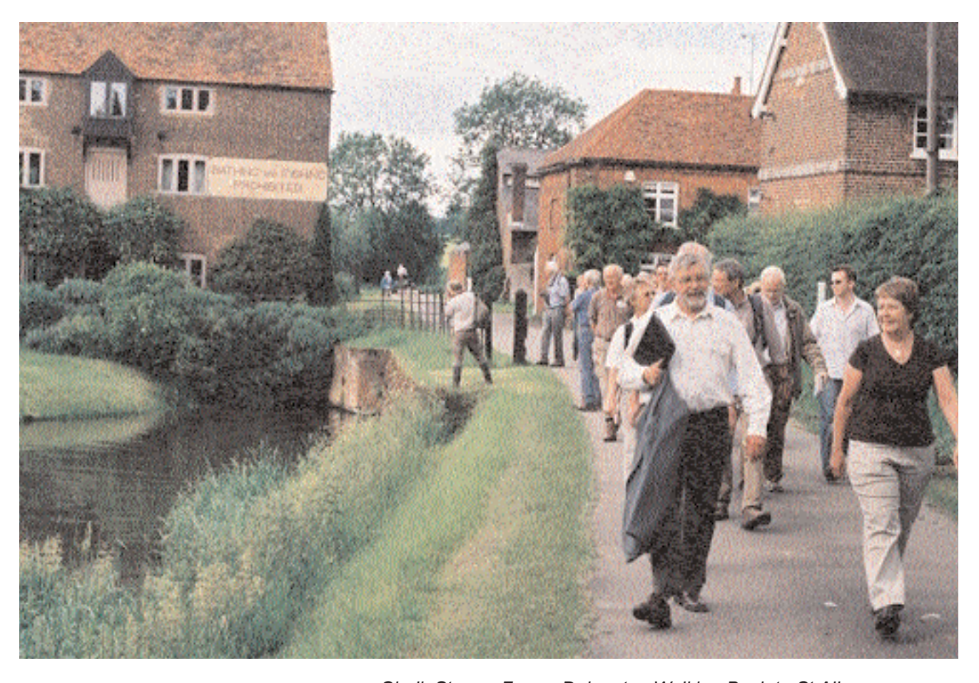
Chalk Stream Forum Delegates Walking Back to St Albans along the Ver