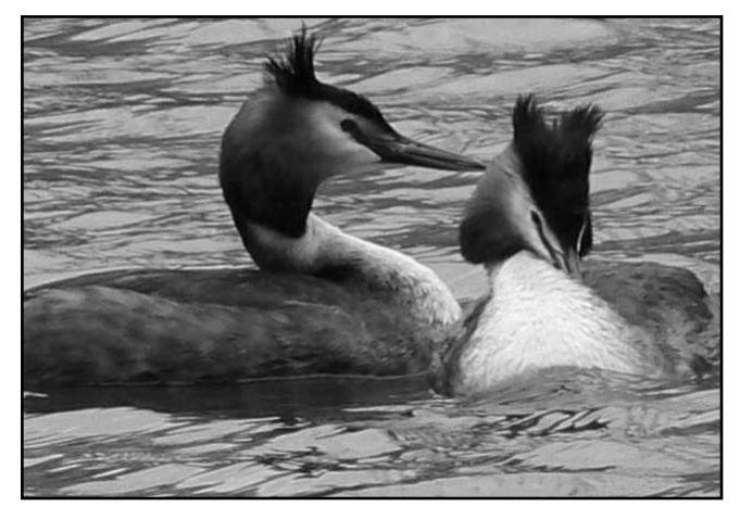
Great Crested Grebes Springtime Display on the Lake - Ian Jinks

Buzzards and red kites are both now firmly established around the valley and although red kites live mainly on carrion I saw one take live prey while on an early morning walk through Gorhambury. Several pairs of lapwing are breeding this year along the Ver and it's great to see the swooping