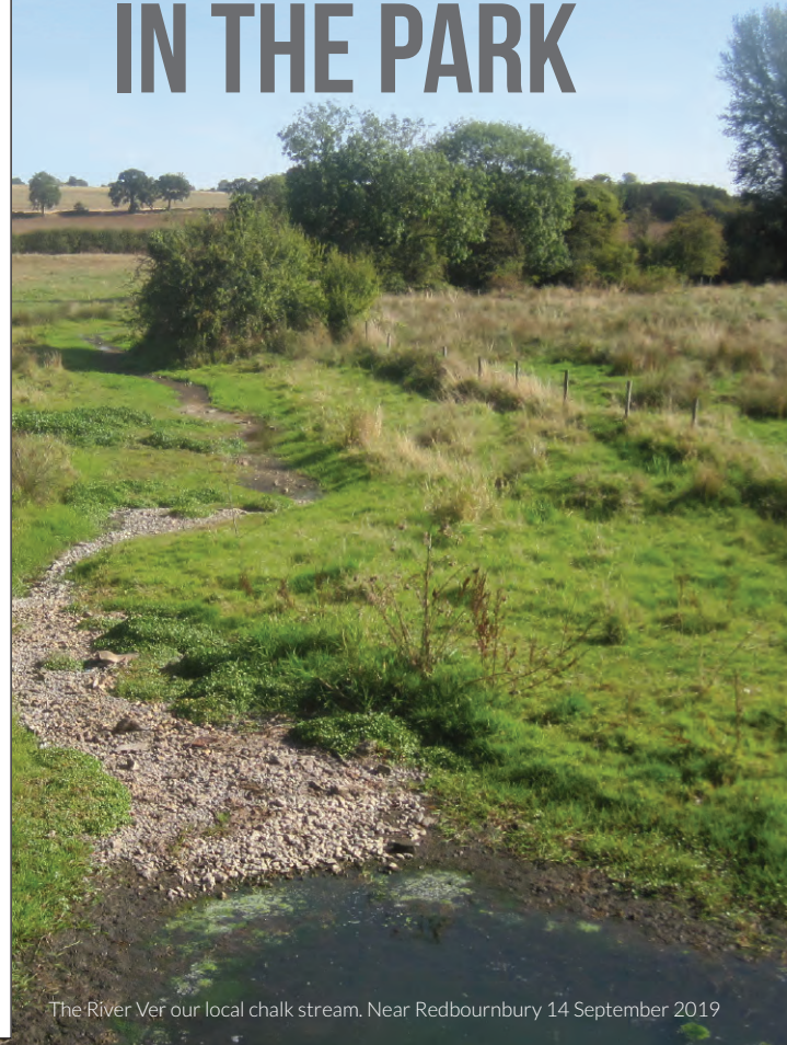
The River Ver our local chalk stream. Near Redbournbury 14 September 2019