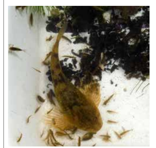
Photo: Olive; A promising sample; Bob resuming Riverfly sampling. Photos: Paul Foster, Jacqui Banfield-Taylor

The widespread drying of the river in early September naturally made kick sampling impossible in many places and when the river did return invertebrate counts were below the trigger in 8 of the 20 sites we monitor.