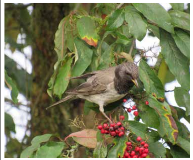
Black-throated Thrush - a rare bird in Britain