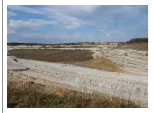
Exposed chalk at Kensworth Quarry

There's a full programme of events scheduled through 2020, all associated with chalk streams and the unique habitat they offer. Here are a few highlights from the coming months.