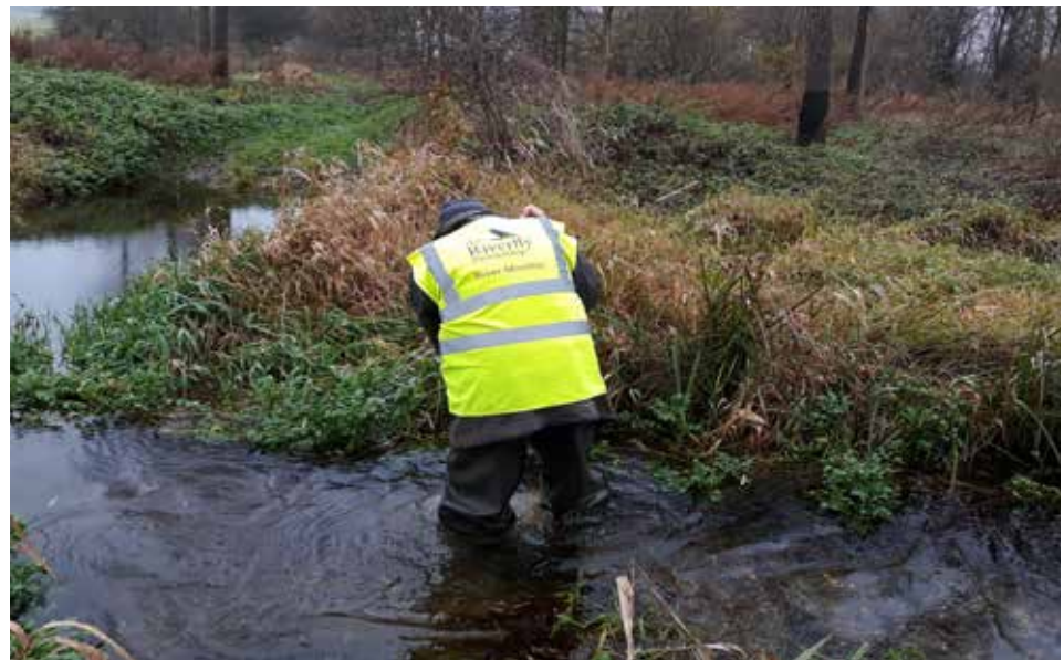
Riverfly invertebrate monitoring is a form of Citizen Science in which trained volunteers monitor the health of rivers across the country. Each site has a trigger level set dependent on the number of species and their usual abundance. If the score falls below the trigger level this usually indicates contamination of the water and the EA are informed. The VVS monitors 19 sites on the Ver.

Finally, we have two vacant monitoring sites: the top end of Riverside Way and the Frogmore Road bridge, which I would love to fill in 2020. Training is provided and monitoring kits are usually available. If you would like to participate in this 'Citizen Science Scheme' please contact me: sdfrearson@virginmedia.com.