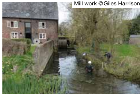
Mill work

Finally, in May, two teams of six tackled overhanging trees that were debris traps in the river and created useful brush piles for invertebrates and reptiles on the bank.