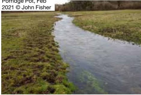
Porridge Pot, Feb 2021

sections of the Ver. There were Redwings and Fieldfares aplenty until the end of April. The latter known in Saxon as 'Fledware', for 'Traveller of the Fields'. Swallows and Martins are zipping across fields and hedgerows now. Wagtails are wading along the muddy river edges.