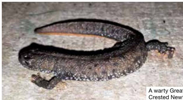
A warty Great Crested Newt