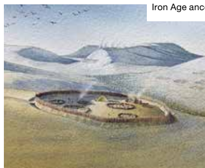
Iron Age ancestors ; Bats in the Park