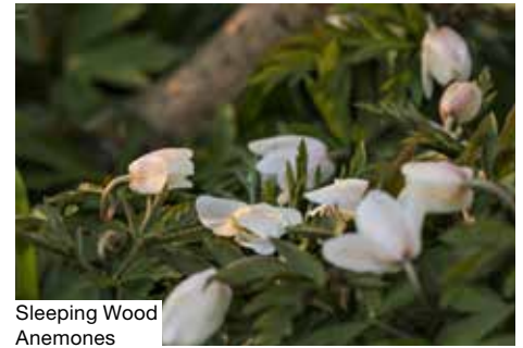
Sleeping Wood Anemones

Across the fields Brown Hares have been seen bounding. Natural pest-control, Moles and Badgers have been aerating the earth. In the marshy mid-valley, a Great Crested Newt wandered, the first reported in many years. Darting Sticklebacks and dappled Brown Trout have been spotted enjoying the flow. All this and more noted by the bailiffs.