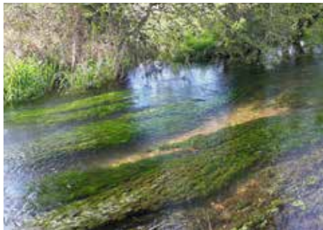
From top: Wet feet at the stepping stones in April; Across the path on Gorhambury 06.05.21; Good flow means good Ranunculus. Right: Verulamium Park still wet in May

Thanks to the Environment Agency and Affinity Water for supplying groundwater and river flow charts.