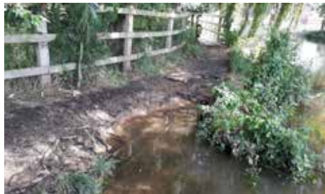
West Ford repairs would be popular

With surprising speed Affinity Water and their consultants Jacobs announced in February that they would be 'revitalising' this much-loved stretch of river and wetland. Of course nothing can proceed without stakeholder approval and rounds of consultation are underway with a final preferred option to go before stakeholders in July. The Society and local members have been considering the possibilities in earnest.