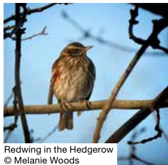
Redwing in the Hedgerow

With the wildflowers come the welcome sight of butterflies with Speckled Wood and Orange Tip on the wing.