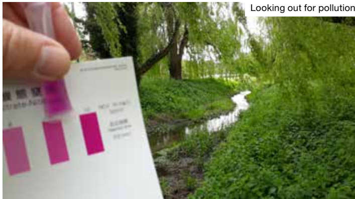
Looking out for pollution

The high groundwater and above average flow on the Ver and many other chalk streams appears to have given the Environment Agency and water companies the opportunity to pedal more slowly on the topic of abstraction reduction. Nonetheless, as we go to press, Affinity has announced that "...plans are underway to reduce extraction at sites on the Rivers Ver, Mimram, Upper Lea and Misbourne by 2024." Whether this refers to the existing 9 million litres a day reduction in 2024 that's long been agreed for St Albans (which will only benefit