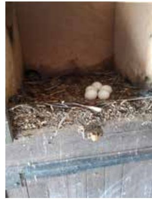
From left: Little Owl; Another Barn Owl box goes up; Little Owl nest recorded by our licenced team below: Little Ringed Plover