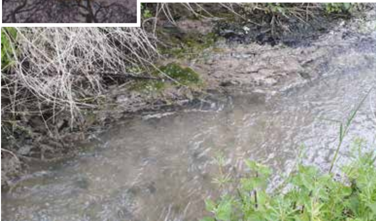
Below: Sewage fungus; A yellow River Red