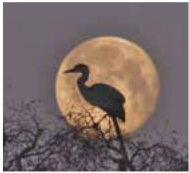
Heron Moon

It's a challenging project with many constraints. There's no extra water entering the Park – remember we have plenty of dry years that cause problems as well as this winter's flooding – but we have done our best to use our local knowledge to positively influence the designs. Will the local residents and herons agree?