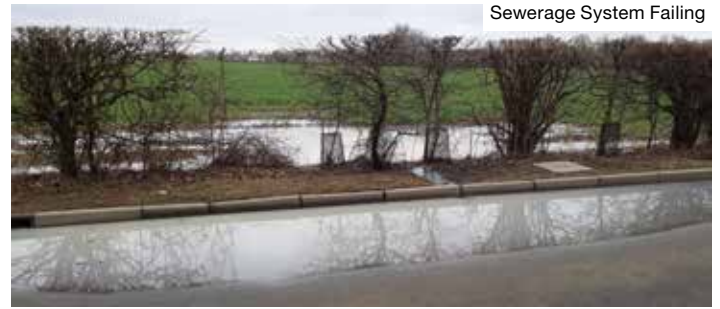
Sewerage System Failing

the very bottom of the Ver) or something incremental and more encouraging for the upper river, remains to be seen. I look forward to confirming it's the latter in the next newsletter!