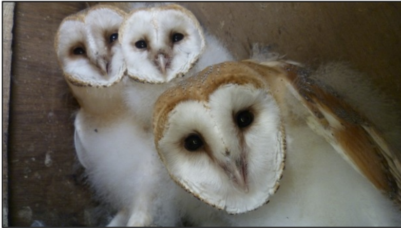
Redbournbury barn owl young 25 June.

It looks as though we will have our best ever year with our Barn Owl Project. I checked all our boxes in mid June and for the first time we have four pairs of barn owls breeding in our valley. There are two pairs with four young each, a pair with two young and two eggs to hatch and one pair in a barn roof space with six eggs. When I check the boxes I always look to see what prey they have in the "larder" as this is a good indicator as to how well the young are being provided for. Usually there are a few wood mice and voles but this year we found a rabbit in one of the boxes. It was only a quarter size rabbit but still rather a large prey item for a barn owl and I understand is quite unusual.