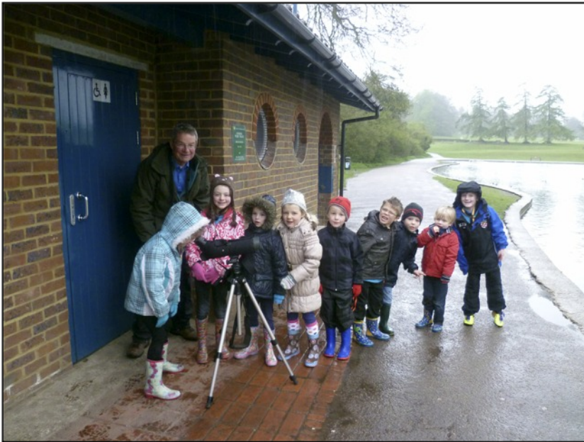
Redbourn Beavers queue to see the heron's nest.