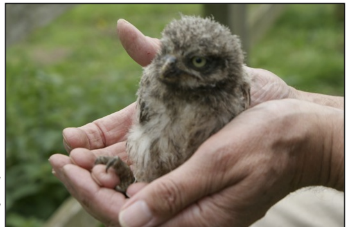
Little owl fledgling ringed at Shafford.

Spotted flycatchers, which still breed in small numbers in Hertfordshire, have been seen regularly in their usual territory near Mayne Farm on the Gorhambury estate.