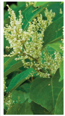
Japanese Knotweed

Thanks to funds made available by Affinity Water, the Ver Valley Society is able to help you access licensed chemical control to impede or eradicate these two aliens at little or no cost to you.